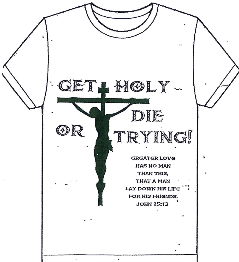
Design 3 Front: